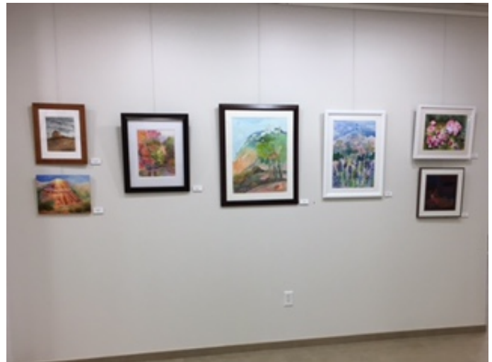
ART FROM THE GALLERY WALL