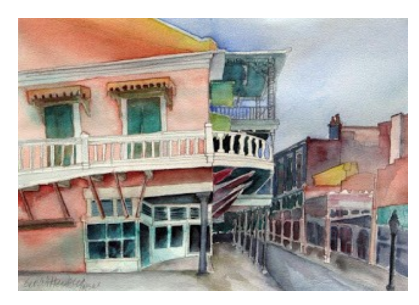
"Royal and Urseline Streets" - 14 in width x 10.50 in height

George Wittenberg has two pieces accepted in the Mena Art Gallery, Southwest Artists Inc. - current show," In the USA"