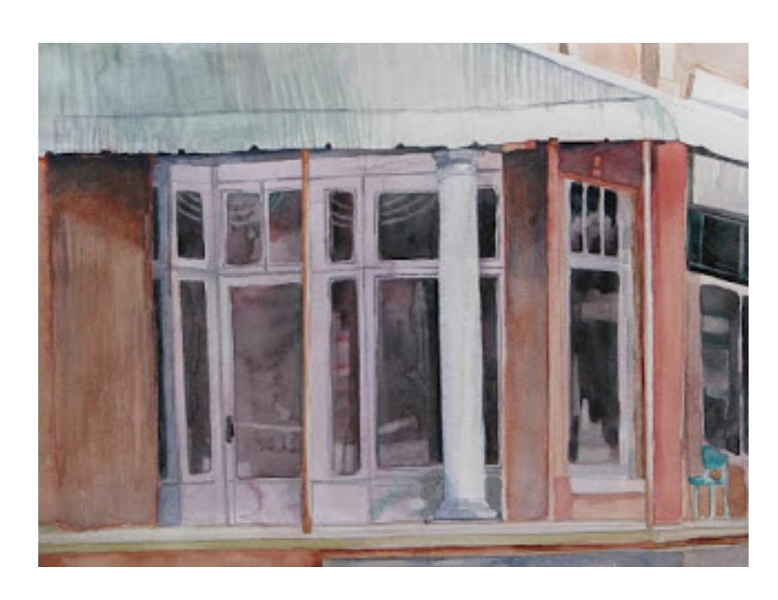
"Store in Shirley" - 14 in width x 10.50 in height